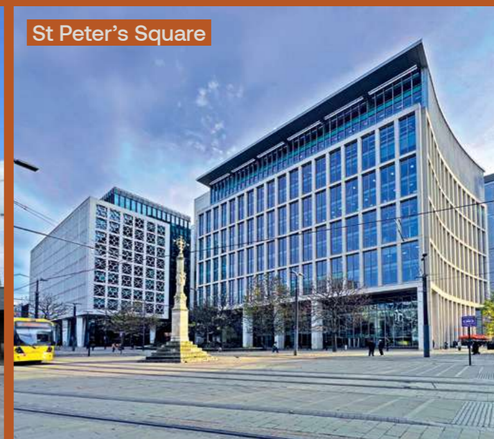
St Peter's Square