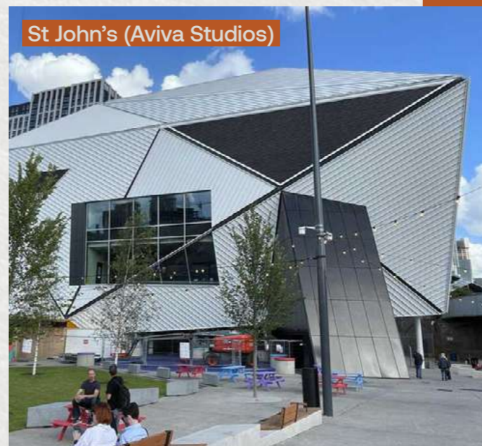
St John's (Aviva Studios)